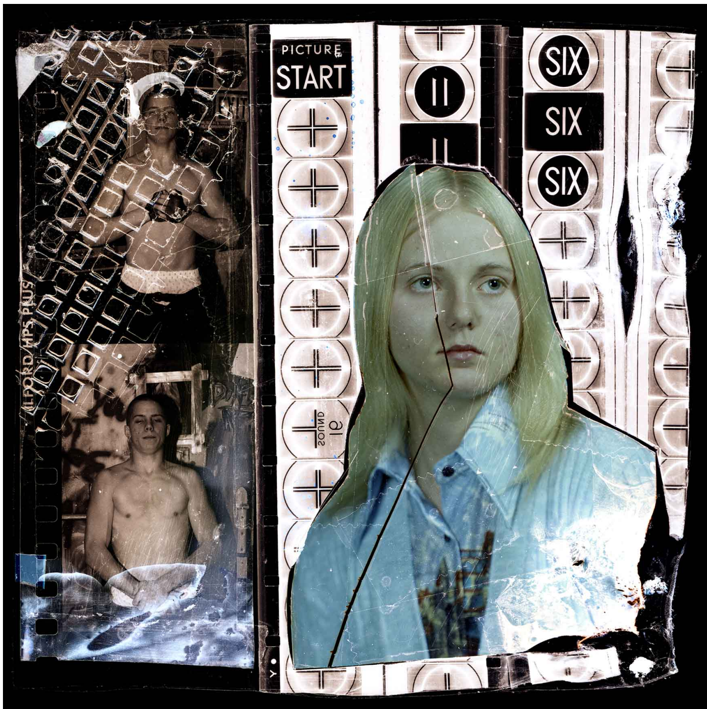
Senior Portrait No.1