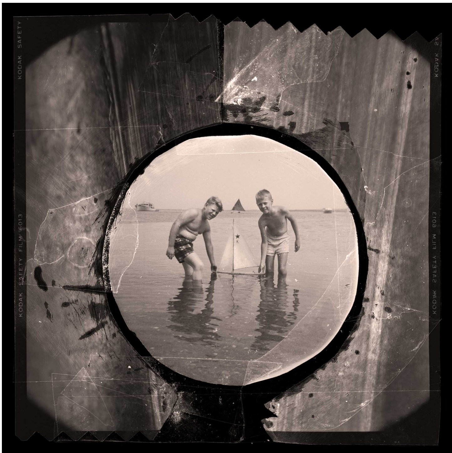
Little Boat – Big Boat